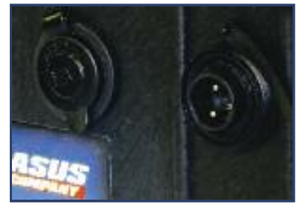
AC & DC Power Input