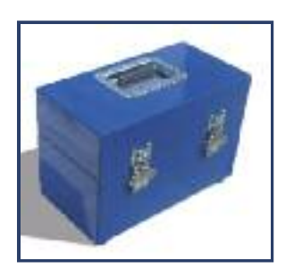
HEAVY DUTY CASE